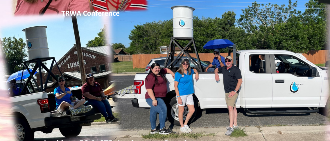
Lockhart 50th CTR Anniversary Parade